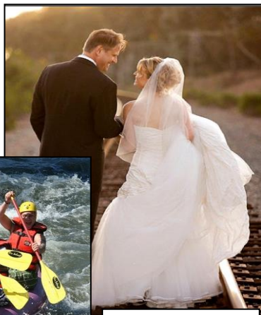
Weddings; group honeymoons