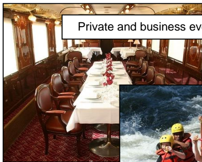
Private and business events

Things to do during layovers are prearranged.